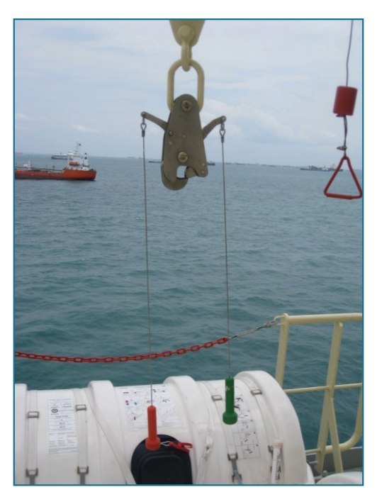
Fig. 12 Off-load release hook for davit launched liferaft