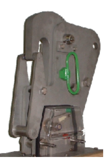
Fig. 6 A safety pin used as a fall preventer device