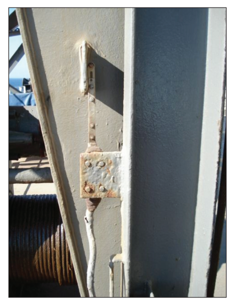
Fig. 4 Limit switch for winch motor