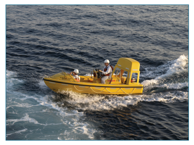
Fig. 11 Rescue boat