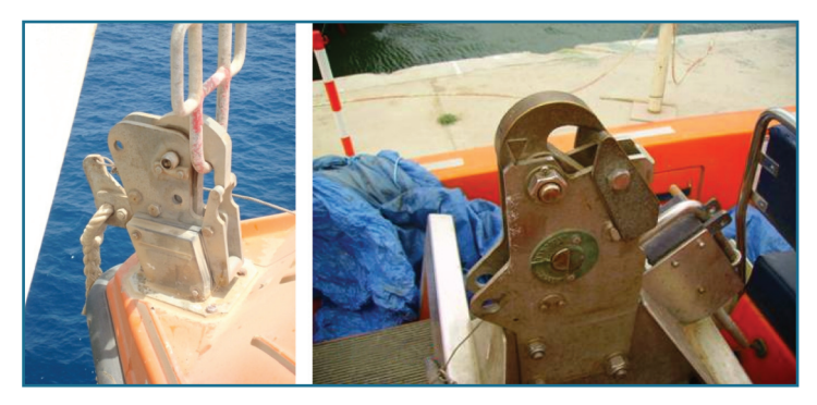
Fig. 7 Examples of different hook arrangements