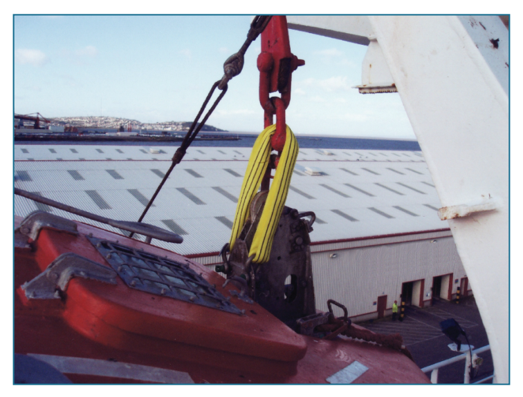
Fig. 5 A synthetic strop as a fall preventer device

it is recommended that no boat should be lowered to, or lifted from, the water during drills or exercises with personnel onboard unless a fall preventer device (FPD) is fitted. The FPD must be fitted before either the gripes or harbour pins are removed