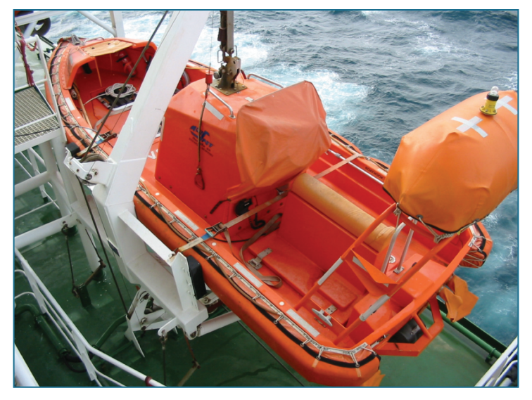
Fig. 10 Rescue boat in stowed position